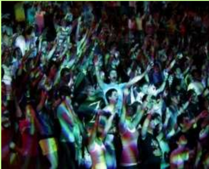
Here is a picture of a Christian mosh pit:

False Christian leaders just keep sinking lower and lower and their bewitched congregations are following these spiritually sick deviants down the slippery slope to hell! Christian pastors have fallen into such horrible darkness that could have not been conceived even five years ago. They