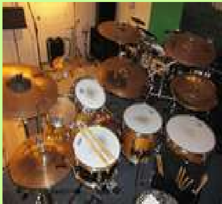
“Drumming Up Jesus”

http://www.youtube.com/watch?v=TAm0hBe7uOo&feature=related